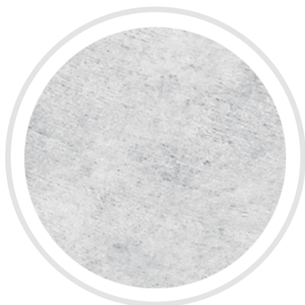
▲ On the market 35gsm Plain fabric

width : 150mm length : 150mm basis weight : 55gsm